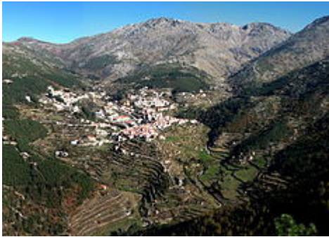
A bridge over a ravine in Loriga, with the pastures of the valley landscape

Known locally as the " Portuguese Switzerland " due to its landscape that includes a principal settlement nestled in the mountains of the Serra da Estrela Natural Park . [2] It is located in the south-central part of the municipality of Seia, along the southeast part of the Serra, between several ravines, but specifically the Ribeira de São Bento and Ribeira de Loriga; [2] it is 20 kilometres from Seia, 80 kilometres from Guarda and 300 kilometres from the national capital (Lisbon). A main village is accessible by the national roadway E.N. 231, that connects directly to the region of the Serra da Estrela by way of E.N.338 (which was completed in 2006), or through the E.N.339, a 9.2 kilometre access that transits some of the main elevations (960 metres near Portela do Arão or Portela de Loriga, and 1650 metres around the Lagoa Comprida).