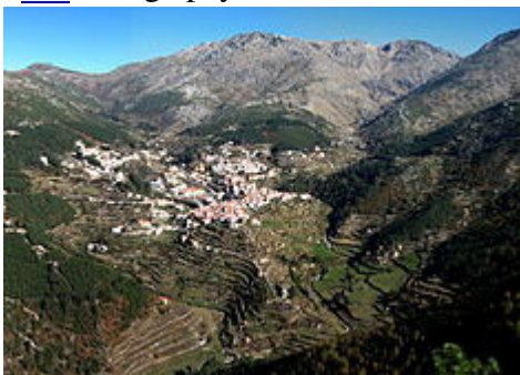
A bridge over a ravine in Loriga, with the pastures of the valley landscape

Known locally as the " Portuguese Switzerland " due to its landscape that includes a principal settlement nestled in the mountains of the Serra da Estrela Natural Park . [2] It is located in the south-central part of the municipality of Seia, along the southeast part of the Serra, between several ravines, but specifically the Ribeira de São Bento and Ribeira de Loriga; [2] it is 20 kilometres from Seia, 80 kilometres from Guarda and 300 kilometres from the national capital (Lisbon). A main village is accessible by the national roadway E.N. 231, that connects directly to the region of the Serra da Estrela by way of E.N.338 (which was completed in 2006), or through the E.N.339, a 9.2 kilometre access that transits some of the main elevations (960 metres near Portela do Arão or Portela de Loriga, and 1650 metres around the Lagoa Comprida).