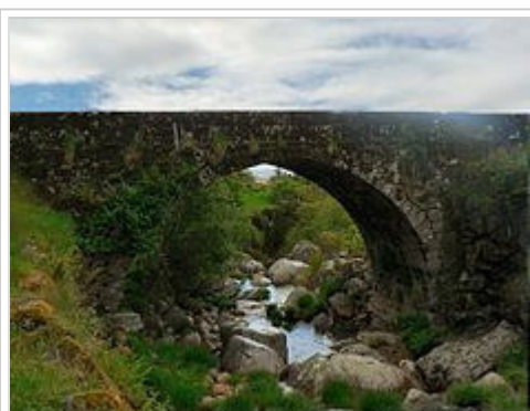
The remaining Roman-era bridge crossing the Ribeira de Loriga

Loriga was founded originally along a column between ravines where today the historic centre exists. The site was ostensibly selected more than 2600 years ago, owing to its defensibility, the abundance of potable water