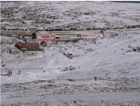
Vodafone Ski Resort, Serra da Estrela, in the town of Loriga.

Textiles are the principal local export; Loriga was a hub the textile and wool industries during the mid-19th century, in addition to being subsistence agriculture responsible for the cultivation of corn. The Loriguense economy is based on metallurgical industries, bread-making, commercial shops, restaurants and agricultural support services. While that textile industry has since dissipated, the town began to attract a tourist trade due to its proximity to the Serra da Estrela and Vodafone Ski Resort (the only ski center in Portugal), which was constructed within the parish limits.