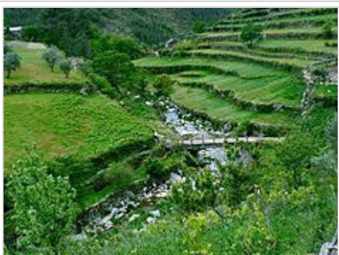
A bridge over a ravine in Loriga, with the pastures of the valley landscape

Known locally as the " Portuguese Switzerland " due to its landscape that includes a principal settlement nestled in the mountains of the Serra da Estrela Natural Park. [2] It is located in the south-central part of the municipality of Seia, along the southeast part of the Serra, between several ravines, but specifically the Ribeira de São Bento and Ribeira da Nave; [2] it is 20 kilometres from Seia, 80 kilometres from Guarda and 300 kilometres from the national capital (Lisbon). A main village is accessible by the national roadway E.N. 231, that connects directly to the region of the Serra da Estrela by way of E.N.338 (which was completed in 2006), or through the E.N.339, a 9.2 kilometre access that transits some of the main elevations (960 metres near Portela do Arão or Portela de Loriga, and