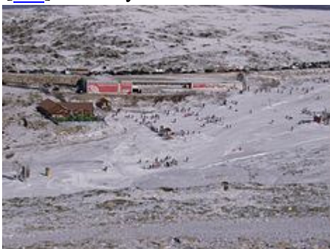
Vodafone Ski Resort , Serra da Estrela , in Loriga.

Textiles are the principal local export; Loriga was a hub the textile and wool industries during the