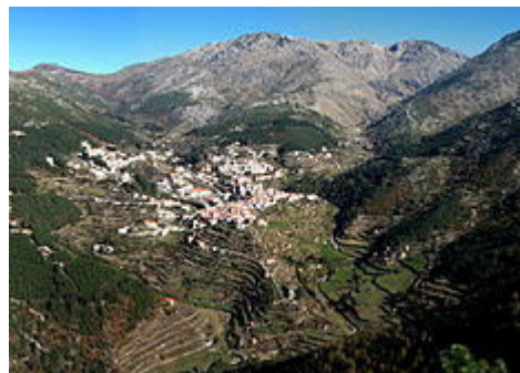
The valley parish of Loriga in the shadow of the Serra da Estrela