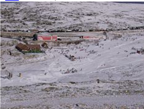
Vodafone Ski Resort , Serra da Estrela , in Loriga.

Textiles are the principal local export; Loriga was a hub the textile and wool industries during the