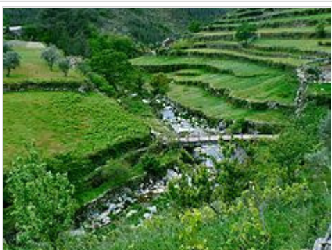
A bridge over a ravine in Loriga, with the pastures of the valley landscape

Known locally as the " Portuguese Switzerland " due to its landscape that includes a principal settlement nestled in the mountains of the Serra da Estrela Natural Park. [2] It is located in the south-central part of the municipality of Seia, along the southeast part of the Serra, between several ravines, but specifically the Ribeira de São Bento and Ribeira da Nave; [2] it is 20 kilometres from Seia, 80 kilometres from Guarda and 300 kilometres from the national capital (Lisbon). A main village is accessible by the national roadway E.N. 231, that connects directly to the region of the Serra da Estrela by way of E.N.338 (which was completed in 2006), or through the E.N.339, a 9.2 kilometre access that transits some of the main elevations (960 metres near Portela do Arão or Portela de Loriga, and