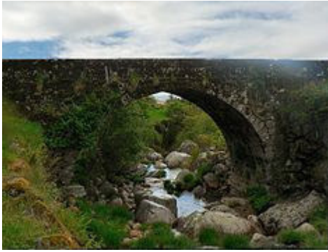
The remaining Roman-era bridge crossing the Ribeira de Loriga

Loriga was founded originally along a column between ravines where today the historic centre exists. The site was ostensibly selected more than 2600 years ago, owing to its defensibility, the abundance of potable water and pasturelands, and lowlands that provided conditions to practice both hunting and gathering/agriculture. [1]