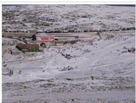
Vodafone Ski Resort, Serra da Estrela, in Loriga.

Textiles are the principal local export; Loriga was a hub the textile and wool industries during the mid-19th century, in addition to being subsistence agriculture responsible for the cultivation of corn. The Loriguense economy is based on metallurgical industries, bread-making, commercial shops, restaurants and agricultural support services.