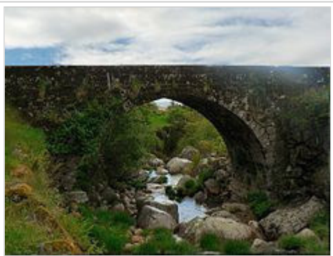
The remaining Roman-era bridge crossing the Ribeira de Loriga

Loriga was founded originally along a column between ravines where today the historic centre exists. The site was ostensibly selected more than 2600 years ago, owing to its