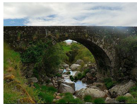
The remaining Roman-era bridge crossing the Ribeira de Loriga

Loriga was founded along a column between ravines where today the historic centre exists. The site was ostensibly selected more than 2600 years ago, owing to its defensibility, the abundance of potable water and pasturelands, and lowlands that provided conditions to practice both hunting and gathering/agriculture. [3]