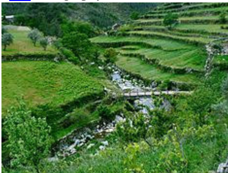
A bridge over a ravine in Loriga, with the pastures of the valley landscape

Known locally as the " Portuguese Switzerland " due to its landscape that includes a principal settlement nestled in the mountains of the Serra da Estrela Natural Park . [2] It is located in the south-central part of the municipality of Seia, along the southeast part of the Serra, between several ravines, but specifically the Ribeira de São Bento and Ribeira de Loriga; [2] it is 20 kilometres from Seia, 80 kilometres from Guarda and 300 kilometres from the national capital (Lisbon). A main city is accessible by the national roadway E.N. 231, that connects directly to the region of the Serra da Estrela by way of E.N.338 (which was completed in 2006), or through the E.N.339, a 9.2 kilometre access that transits some of the main elevations (960 metres near Portela do Arão or Portela de Loriga, and 1650 metres around the Lagoa Comprida).