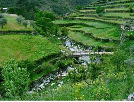
A bridge over a ravine in Loriga, with the pastures of the valley landscape

The region is carved by U-shaped glacial valleys, modelled by the movement of ancient glaciers. The main valley, Vale de Loriga was carved by longitudinal abrasion that also created rounded pockets, where the glacial resistance was minor. Starting at an altitude of 1991 metres along the Serra da Estrela the valley descends abruptly until 290 metres above sea level (around Vide), passing villages such as Cabeça, Casal do Rei and Muro. The central village, Loriga, is seven kilometres from Torre (the highest point), but the parish is sculpted by cliffs, alluvial plains and glacial lakes deposited during millennia of glacial erosion, and surrounded by rare ancient forest that surrounded the lateral flanks of these glaciers.