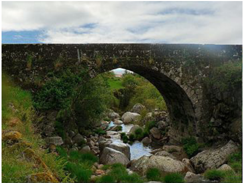
The remaining Roman-era bridge crossing the Ribeira de Loriga

Loriga was founded along a column between ravines where today the historic centre exists. The site was ostensibly selected more than 2600 years ago, owing to its defensibility, the abundance of potable water and pasturelands, and lowlands that provided conditions to practice both hunting and gathering/agriculture. [3]