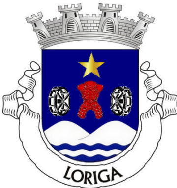
Coat of arms

Statistics from INE (2001); geographic detail from Instituto Geográfico Português (2010)